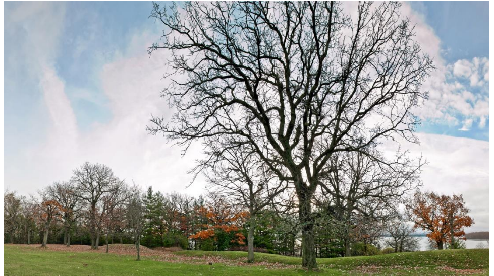
Image 1 - The Serpent Mounds overlooking Rice Lake. The mounds have a long history of opportunistic looting and archaeological investigation, but are now owned and protected by Hiawatha First Nation.

In 2002, the Serpent Mounds was designated a National Historic Site.