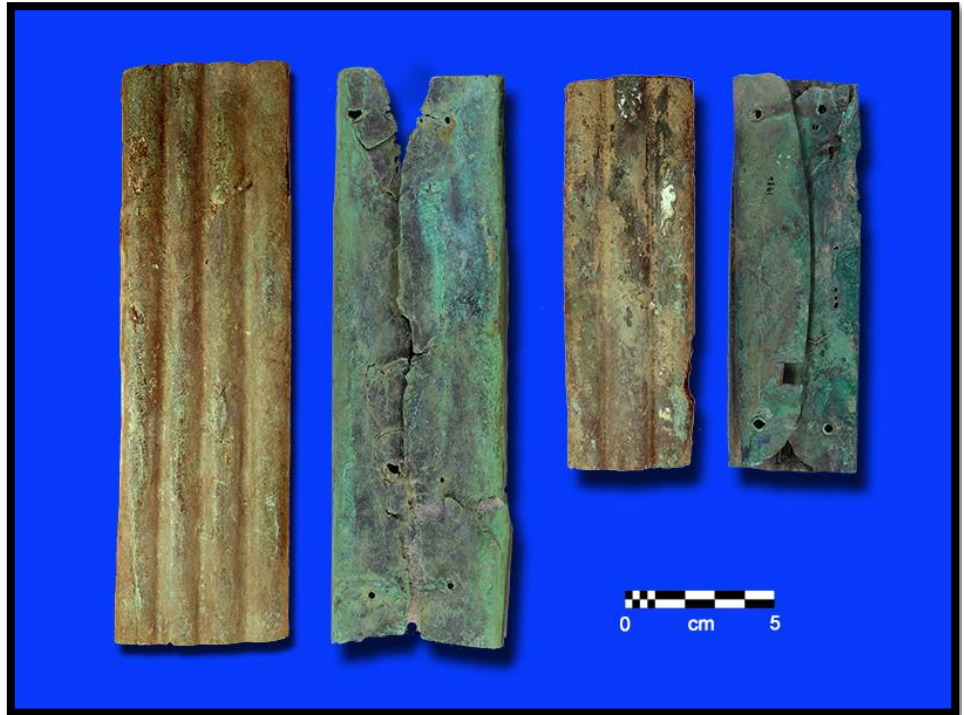
Image 3 – Obverse and Reverse Views of Pan Pipe Burial Gifts from Burials GE and GF at Saugeen Middle Woodland Donaldson Site, Ontario.

Three barrel examples are more common. A photo of the Donaldson panpipe on the right was mistakenly published as from other Ontario sites.